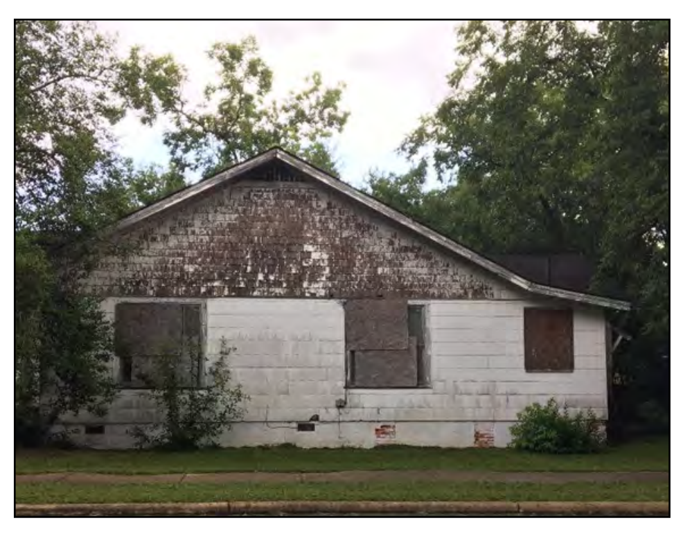
Pictured above is a structure surveyed in the city of Douglas

The URP includes a survey of building conditions throughout the entire City, classifying each structure as either "Sound," "Deteriorating," or "Dilapidated." SGRC staff has braved the heat to perform this important field work