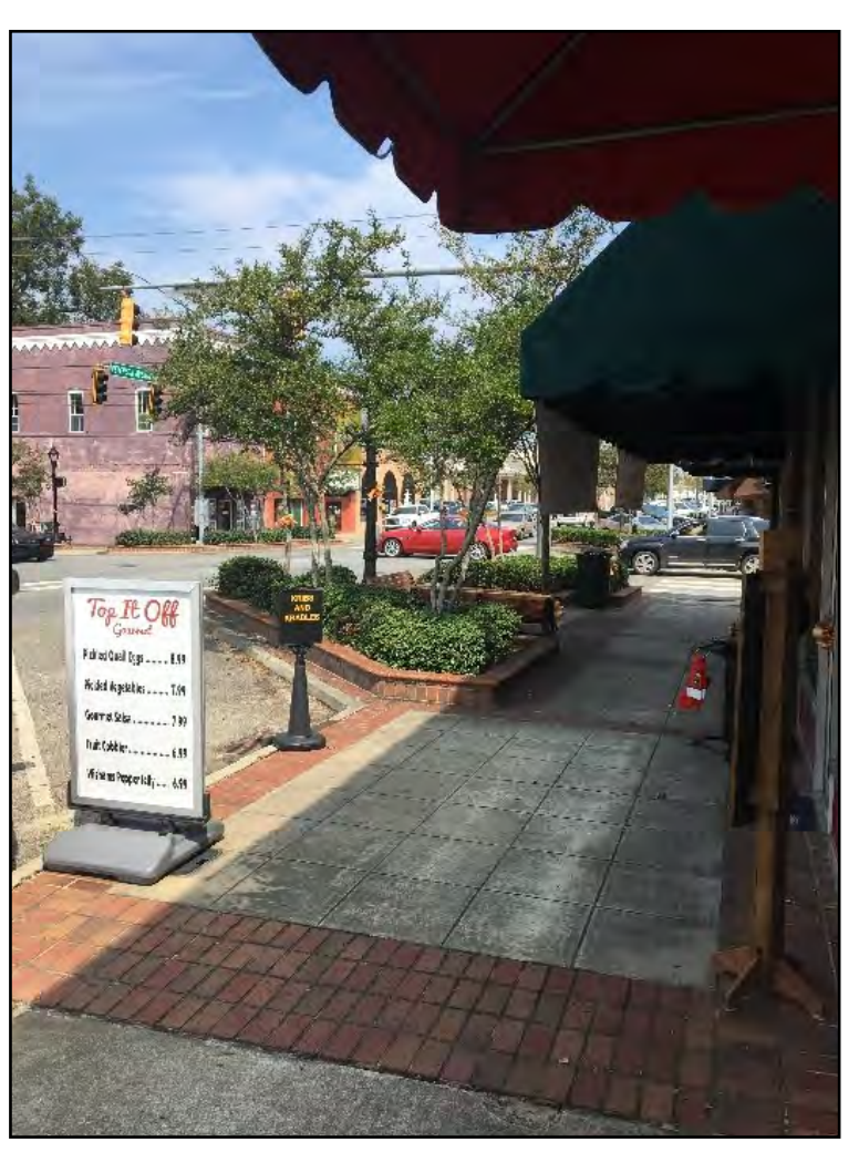
Sidewalk in Douglas, Georgia

The Sidewalk Master Plan brings together material from several previous sidewalk and connectivity plans and provides a comprehensive list of sidewalk projects for the City to implement. The projects all consist of new sidewalks that are to be provided on street sections that currently have no sidewalk. Each project is given a score and rank, produced via a methodology that was developed specifically for this plan. Projects are scored based on the following nine categories: Connectivity to destinations; whether the project would fill a gap in the sidewalk network; presence of a "cow path" where the terrain is